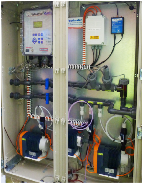
Coolplex Web Master