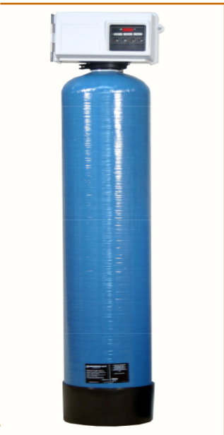
An Iron & Manganese filter with a Fleck 2510 valve, Clack valves also available.

A water analysis should always be the starting point for the specification of an Iron and Manganese removal system. A filtration system can then be tailor made to suit the individual water chemistry. This often involves the use of one or more of the filters shown on the diagram on the right. These can help the main catalytic filter achieve the desired results.