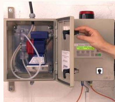
Water Treatment Equipment