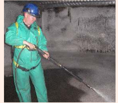
Disinfection and Cleaning

Our unique non-acidic cleaning agent Corrospense 84 is ideally suited for both pre-commission and renovation cleaning of heating and chilled water systems.