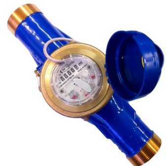
Water Meter Controlled